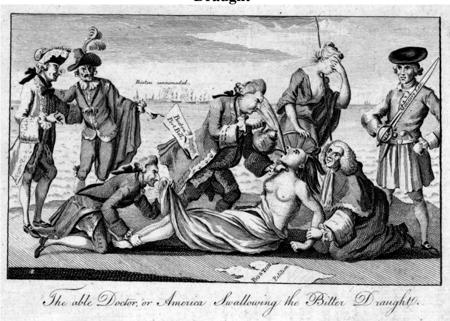
Figure 1: The Able Doctor, or America Swallowing the Bitter Draught<sup>76</sup>

comforts of life . . . and to live like savages, if the Parliament will not consent to give up its authority."<sup>75</sup>