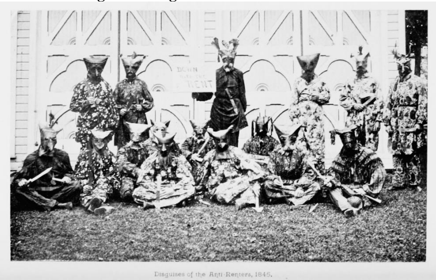
Figure 4: Disguises of the Anti-Renters<sup>214</sup>

It may seem bizarre to find this eighteenth-century style of political engagement, the mobbing of "groups who could find no alternative institutional expression for their demands and grievances, which were more often than not political," enduring into the 1840s.<sup>215</sup> We are used to celebrating, along with the Founders, the creation of a rational, participatory government in which law is based on the consent of the governed. The white Indian tradition is, by contrast, a carnivalesque spectacle, involving ritualistic demonstrations of the people's raw physical power, and it seems a relic of a legal regime characterized by hierarchy and inherited position. Its continued usefulness suggests that many Americans—even white, male Americans—did not experience the transition from status to contract, from hierarchy to equality, from the politics of deference to the politics of reasoned persuasion. If, indeed, this is part of the explanation, the symbol's late appearance in the context of the feudal estates of upstate New York makes perfect sense.