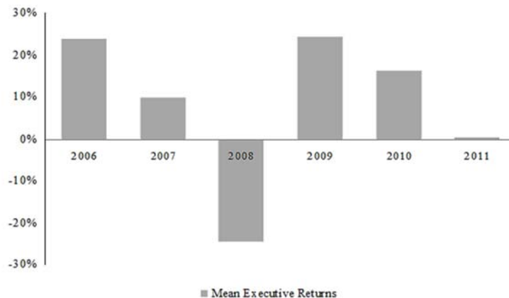
Figure I: Average Executives' Returns on Defined Contribution Retirement Pay, 2006–2011

As Figure I shows, the value of defined contribution retirement pay is not fixed, but fluctuates considerably over time. And those fluctuations are consistent with changes in stock-market returns. For example, in 2006, when stocks in the S&P Composite 1500 Index performed